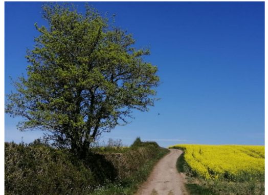
"Our Hourly Walk"