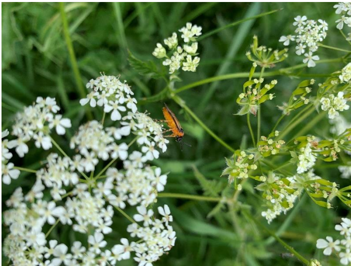
'Take flight' by Rik Judges (adult)