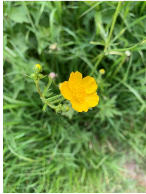
'Bright like the sunshine' by Tilly Judges - Birch 2